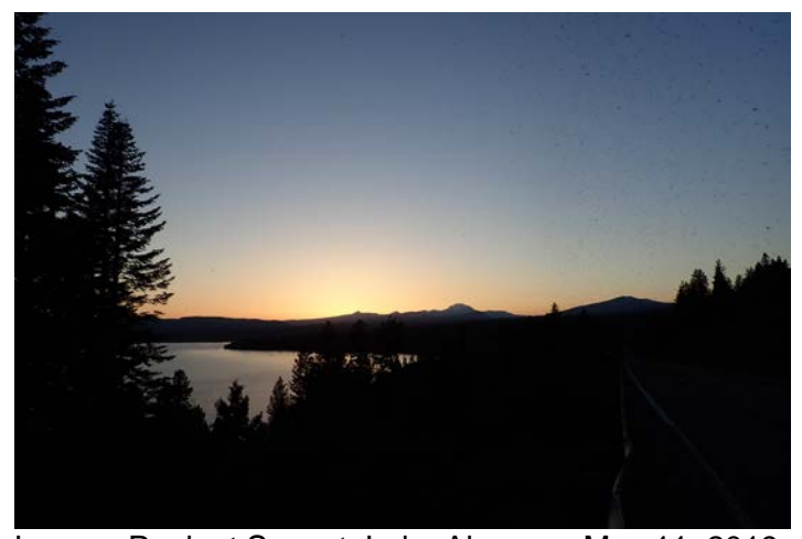
Lassen Peak at Sunset, Lake Almanor, May 11, 2019