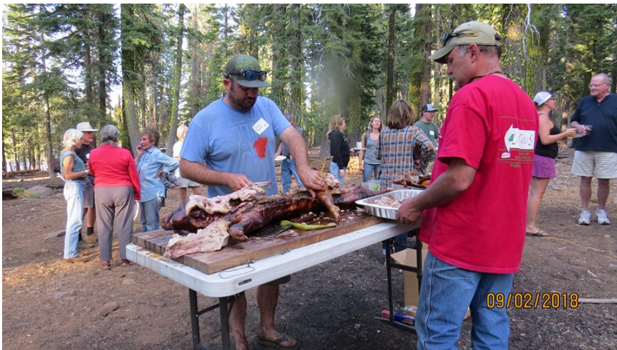
The Great Roast Pig