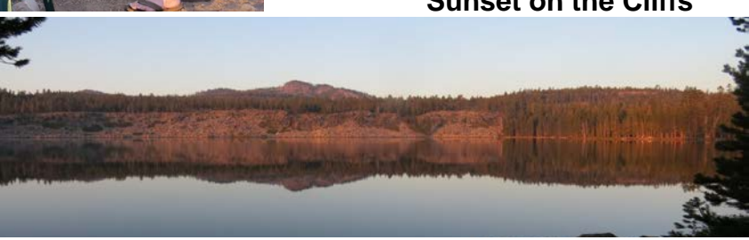
Sunset on the Cliffs